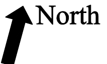
EXHIBIT HALL "C"